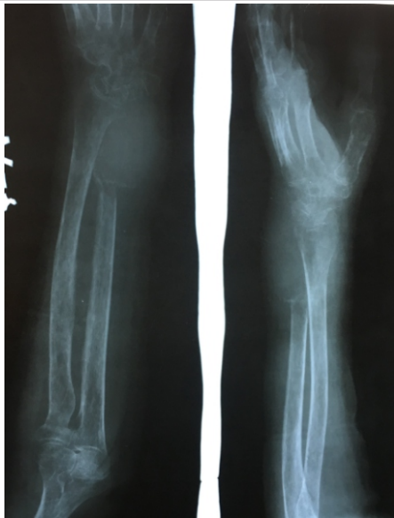
Figure 1: Pre-Op X-ray Of the Patient