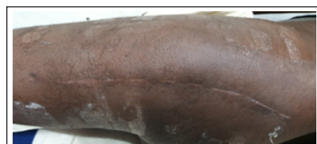
Figure 3: Trochanteric Bursitis

In this study we have hypothesized that a higher concentration of bisphosphonate at the pathological site can bring better results compared to systemic administration where the drug is distributed evenly across the body and added microdecompression drill holes will also help to reduce intraosseous pressure as well as act as channels for intraosseous bisphosphonate injection. We combined two different treatment modality i.e. safe surgical dislocation with micro core decompression combined with intralesional zoledronic acid, to achieve