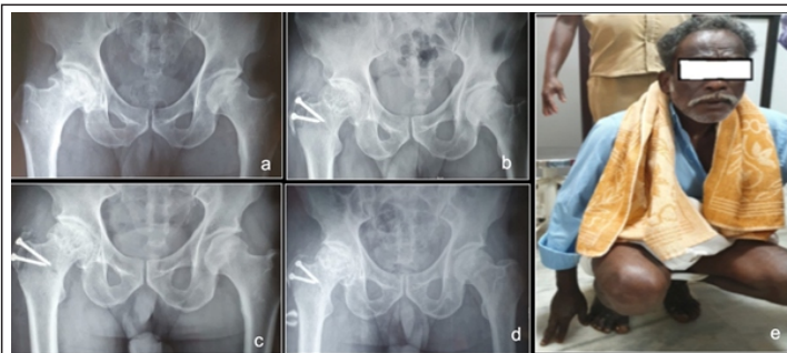
Figure 2: a) Preoperative Radiograph b) Postoperative Radiograph at 6 months c) Postoperative Radiograph at 12 months d) Postoperative Radiograph at 24 months e) Function at 2 year followup

osteonecrotic lesion site, thus promoting bone healing and preventing the onset of collapse or fracture of subchondral bone [12,13]. Commonly studied bisphosphonate in literature is alendronate which is an oral drug and is reported to be effective in reducing the collapse rate over 50% compared to the placebo groups at doses of 10 mg/day or 70 mg/week [9]. But there have been no studies in the literature where a bisphosphonate has been administered locally to achieve higher concentration along multiple microdecompression holes and thereby achieving better bioavailability at the pathological site.