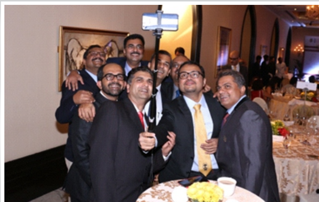
Figure 3: Bombay orthopaedic society past presidents dinner –December 9 th , 2015.