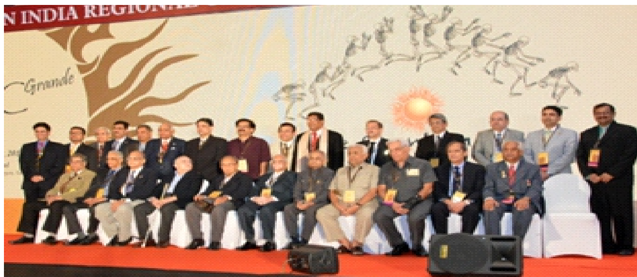
Figure 1: “Photograph of the century.”

catering facilities ensured that academic sessions remained undisturbed while still allowing strong interaction between delegates and trade partners.