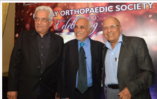
Figure 2: Legends of Indian orthopaedics.

Beyond academics, WIROC Grande 2015 celebrated the traditions of BOS: