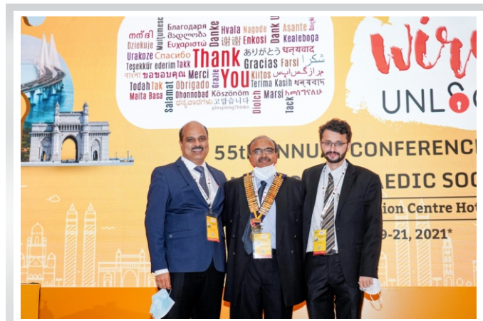
Figure 6: And we did it.... The look of relief on our faces at the end of Western India Regional Orthopaedic Conference 2020 Unlocked....The team signing off.....!!.

most challenging yet fulfilling projects of our careers. It demanded everything – vision, stamina, negotiation, humility, and leadership. But the smiles, the gratitude, the shared learning – it made it all worth it.