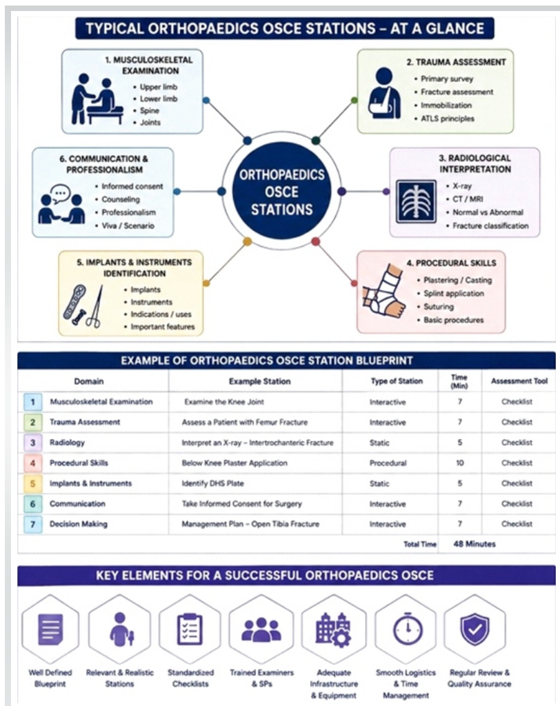
Figure 2: Stations of OSCE

gaps in student performance but also promotes systematic learning, clinical reasoning, and skill-based training. Despite challenges such as the need for significant resources, faculty training, and logistical organization, OSCE continues to play an increasingly important role in modern orthopaedic education and competency-based medical training. This review aims to discuss the structure, applications, advantages, limitations, and educational impact of OSCE in orthopaedic practical examinations.